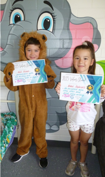
Resilience Excellence Self-management Perseverance Empathy Courage Teamwork